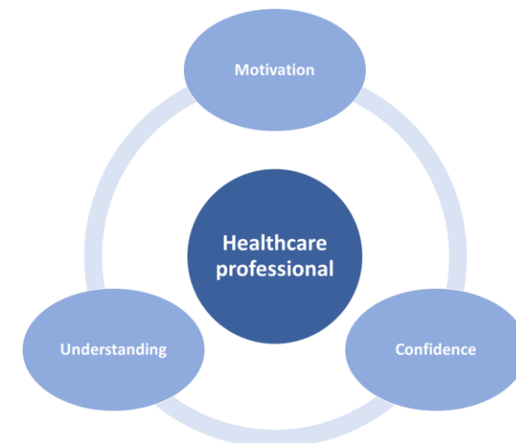
Figure 1. Healthcare professionals pre-conditions

Background The Utrecht Symptom Diary – 4 Dimensional (USD-4D) is a patient-reported outcome measure (PROM) with conformed helpfulness in day-to-day care. It supports patients, loved ones, and healthcare professionals in structurally assessing the intensity of symptoms and issues.